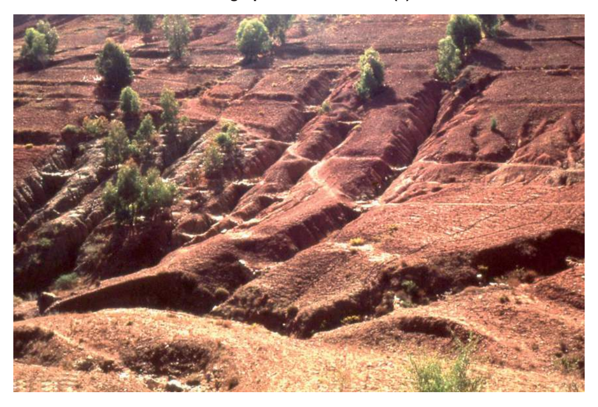
Photograph B for Question 6(c)